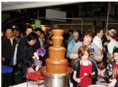
Showcase features more than 20 area restaurants

Featured highlights include free food samples from more than 20 area restaurants, business and industry booths, interactive activity booths hosted by DCTC programs, college information booth, games, entertainment, and many other activities for the whole family! Attendance at the 2009 event was estimated between 3,000-3,500 visitors.