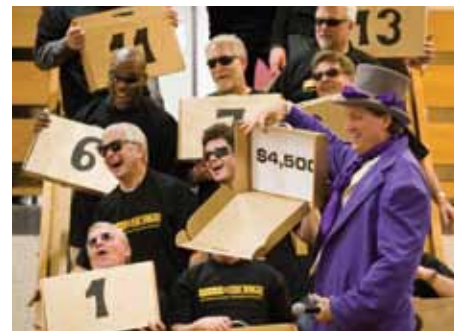
Scholarship games are a highlight of the evening