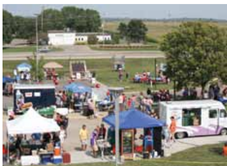
Septemberfest attracts more than 5,000 visitors

Featured highlights include Scholarship In A Haystack, DCTC Dash 5K Run, children's activities and games, live music and entertainment, contests and activities for adults, arts and crafts vendors, food vendors, college information booth, and much, much more. Attendance at the 2009 event was estimated between 4,500-5,500 people.