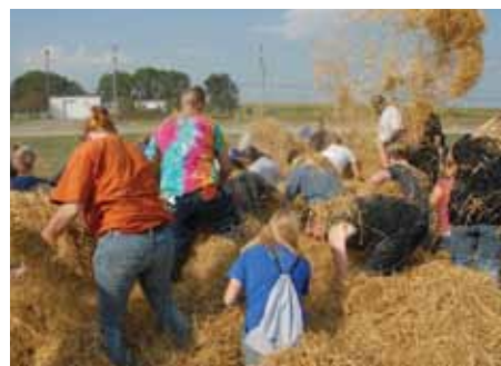
Scholarship In a Haystack is the most popular event