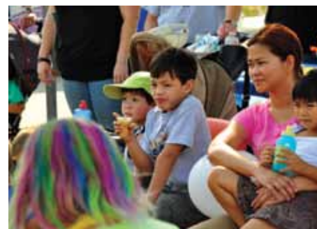
The day features a variety of games and activities

What's most important at DCTC is our unbreakable commitment to our students and graduates, who know better than anyone the three most important outcomes of the higher education experience: jobs, jobs, jobs.